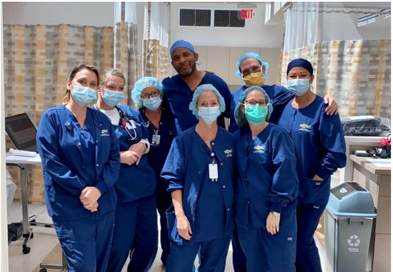
The St. Croix Surgery Center medical staff.

The St. Croix Surgery Center (SCSC) achieved a milestone in February 2021, performing the first outpatient total knee replacement in the United States Virgin Islands. In a recently issued release, the center said is setting new standards of care for the Virgin Islands and the Caribbean by offering these specialized surgical procedures, total joint replacements of the knee and hip in an outpatient setting, which allows patients to recover in the comfort of their home or at a peaceful Island retreat the same day as their surgery.