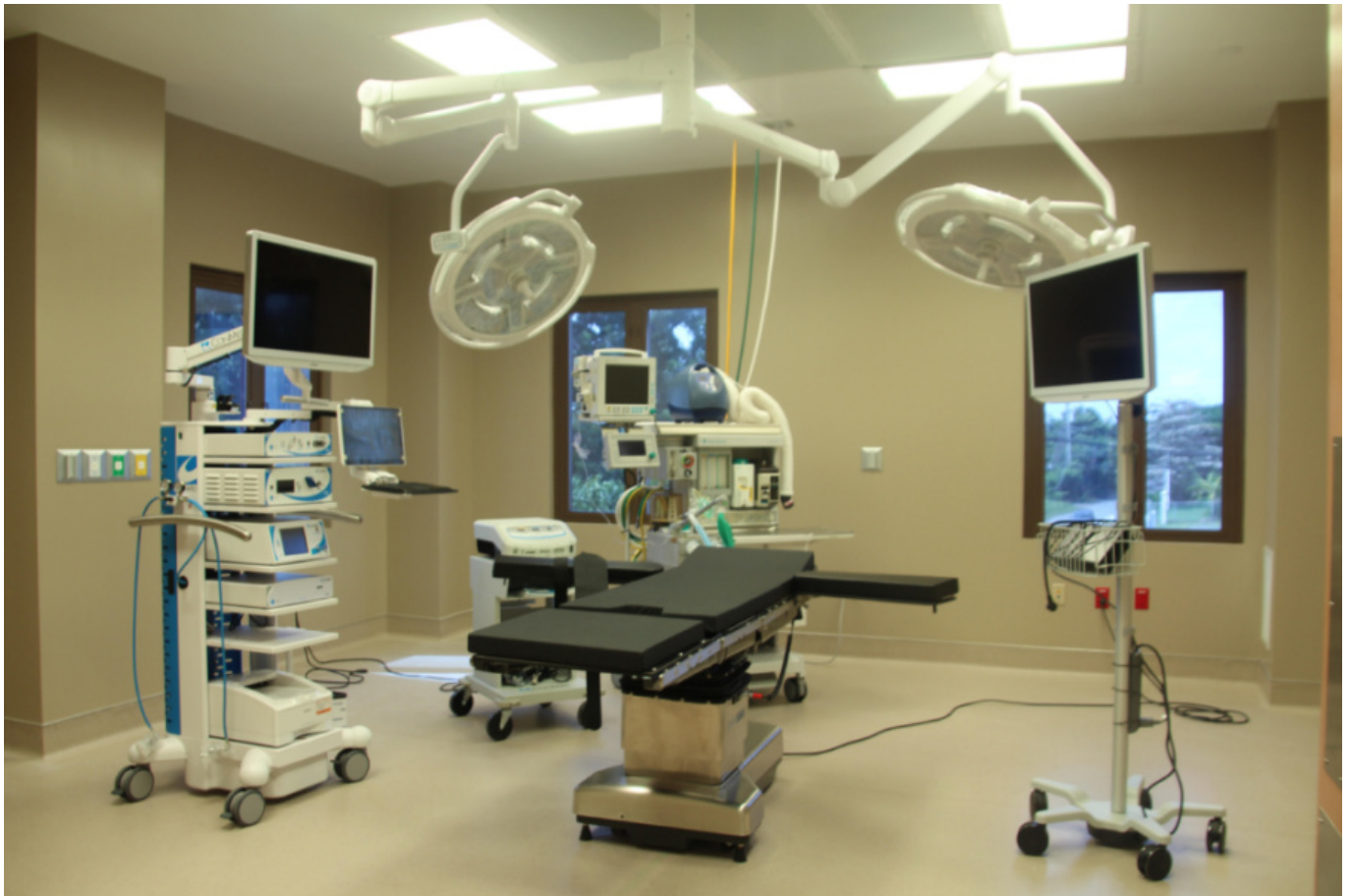
State-of-the-art surgical equipment at the St. Croix Surgery Center.

St. Croix Surgery Center is the first and only ambulatory surgical center in the Virgin Islands offering total joint replacements. The medical facility is located at 4006 Estate Diamond, Suite 203 (know the facility known as the Viya building), and is a multi-specialty surgery center fully accredited by the Accreditation Association for Ambulatory Health Care (AAAHC) and is CMS/Medicare certified.