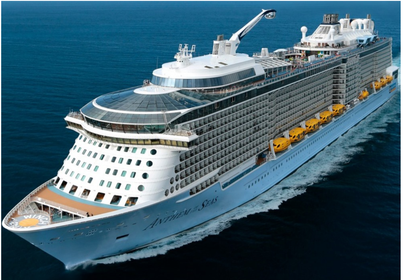
Anthem of the Seas

HAMILTON, Bermuda, CMC — Passengers came ashore at Dockyard early on Wednesday from the cruise ship Anthem of the Seas, delayed last week in New Jersey over a coronavirus (Covid-19) scare.