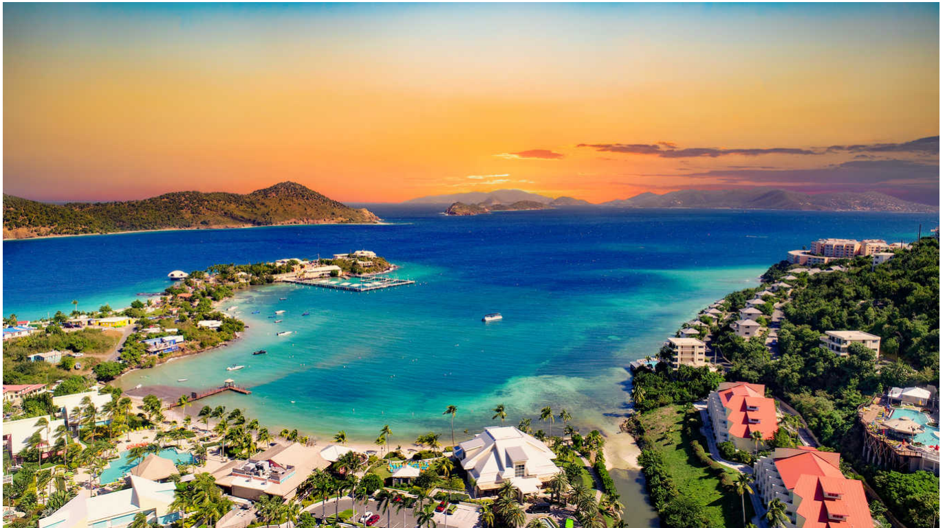
ST. THOMAS USVI

The U.S. Virgin Islands has received the “Destination of the Year” award from Caribbean Journal, a digital Caribbean travel news publication.