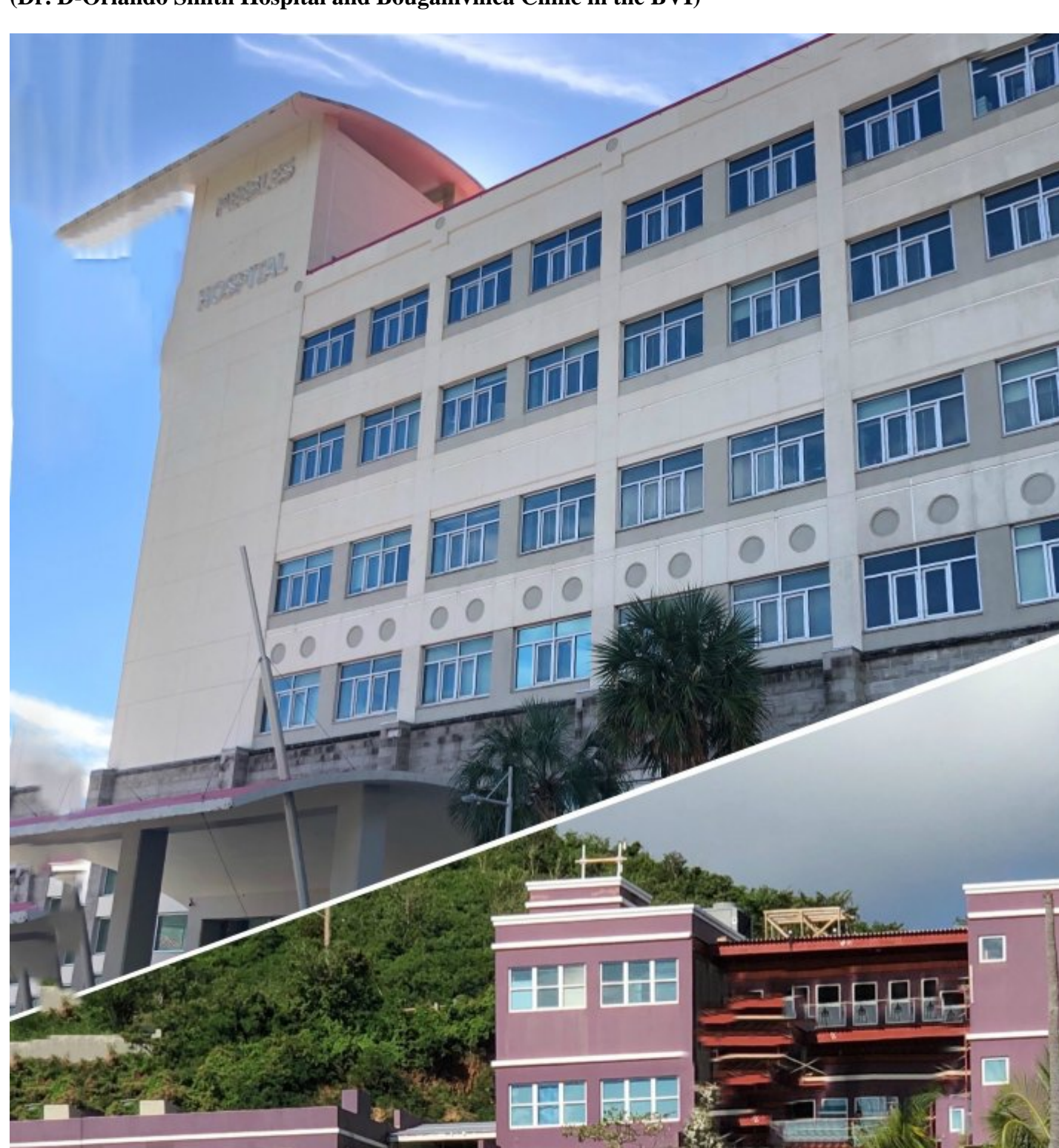
(Dr. D-Orlando Smith Hospital and Bougainvillea Clinic in the BVI)