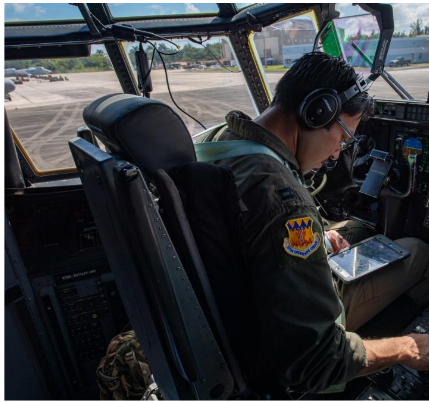
U.S. Air Force pilot assigned to the 317th Airlift Wing, prepares for a flight from the Luis Muniz Marin International Airport in Carolina, Puerto Rico, Feb. 24, 2023.