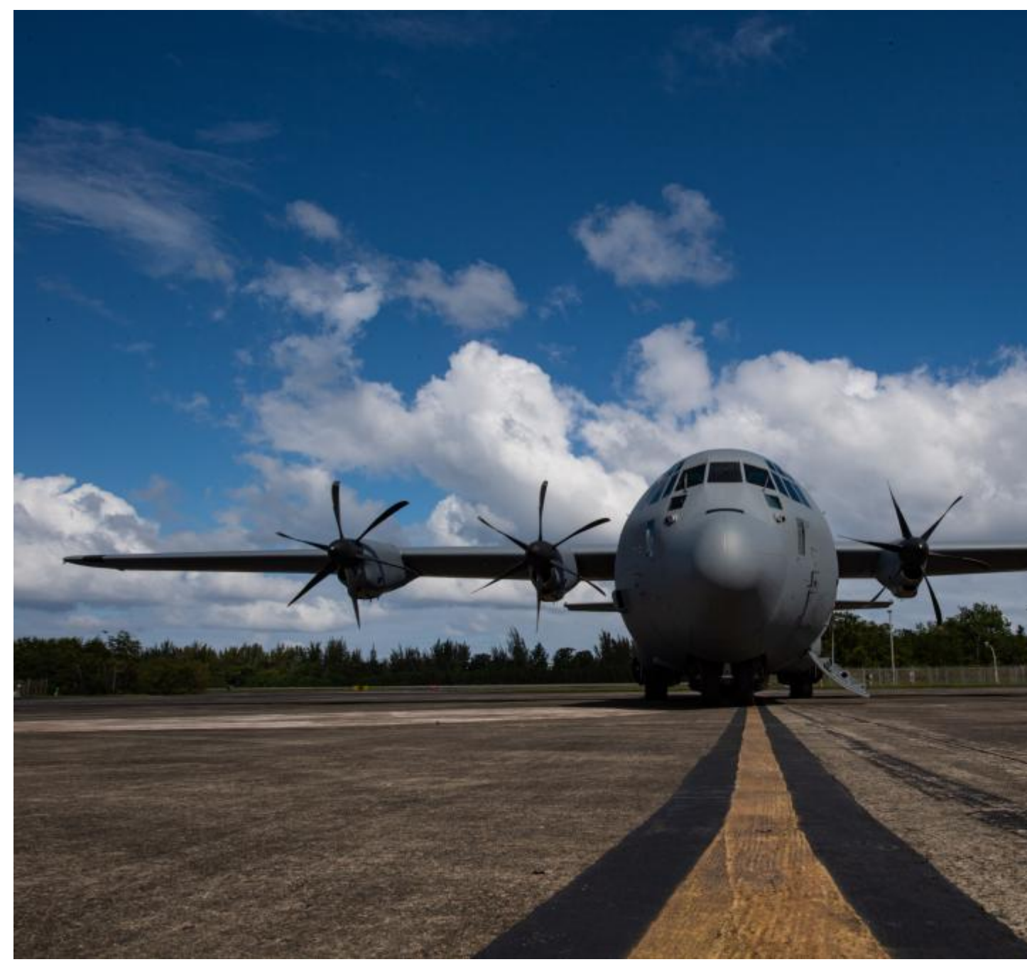
A U.S. Air Force C-130J Super Hercules assigned to the 317th Airlift Wing sits at the Luis Muniz Marin International Airport in Carolina, Puerto Rico, Feb. 24, 2023.