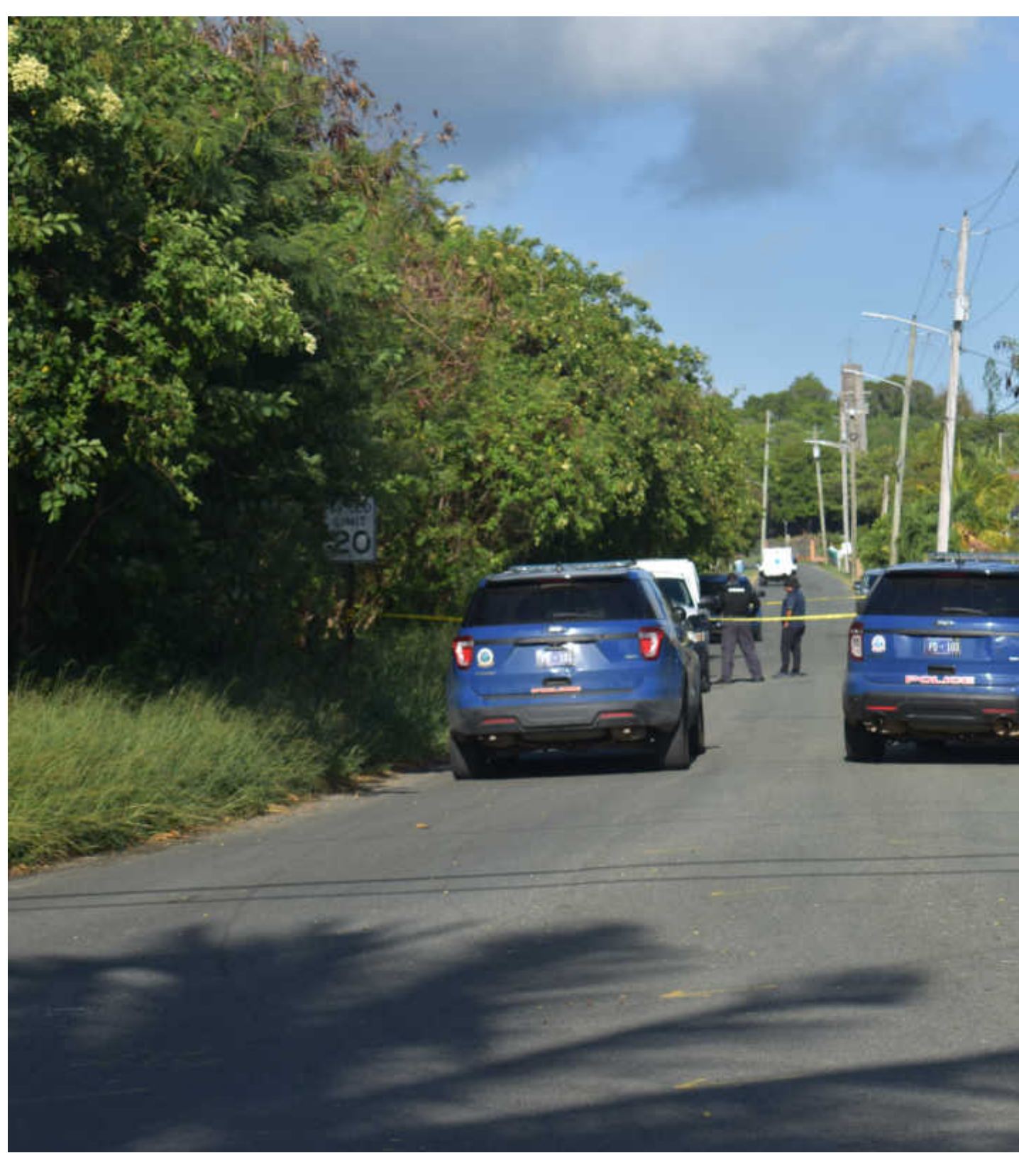
VIPD investigators on location on a roadway in Estate St. John on St. Croix on June 1, 2021, located roughly 100 yards from affluent community Judith's Fancy's entrance.