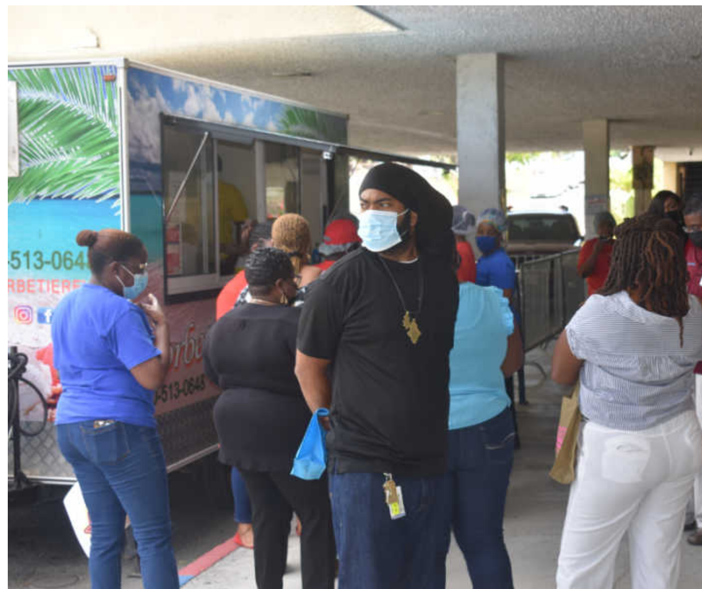
JFL employees form a line to be treated with ice cream from Sorbetiere VI, and to receive gift bags from the Dept. of Tourism.

The effort was part of the V.I. Dept. of Tourism's planned activities for Tourism Week, which this year focused on showing appreciation to workers on the frontlines. Employees of the medical field have been thrusted to the forefront as the world continues to battle the Covid-19 pandemic.