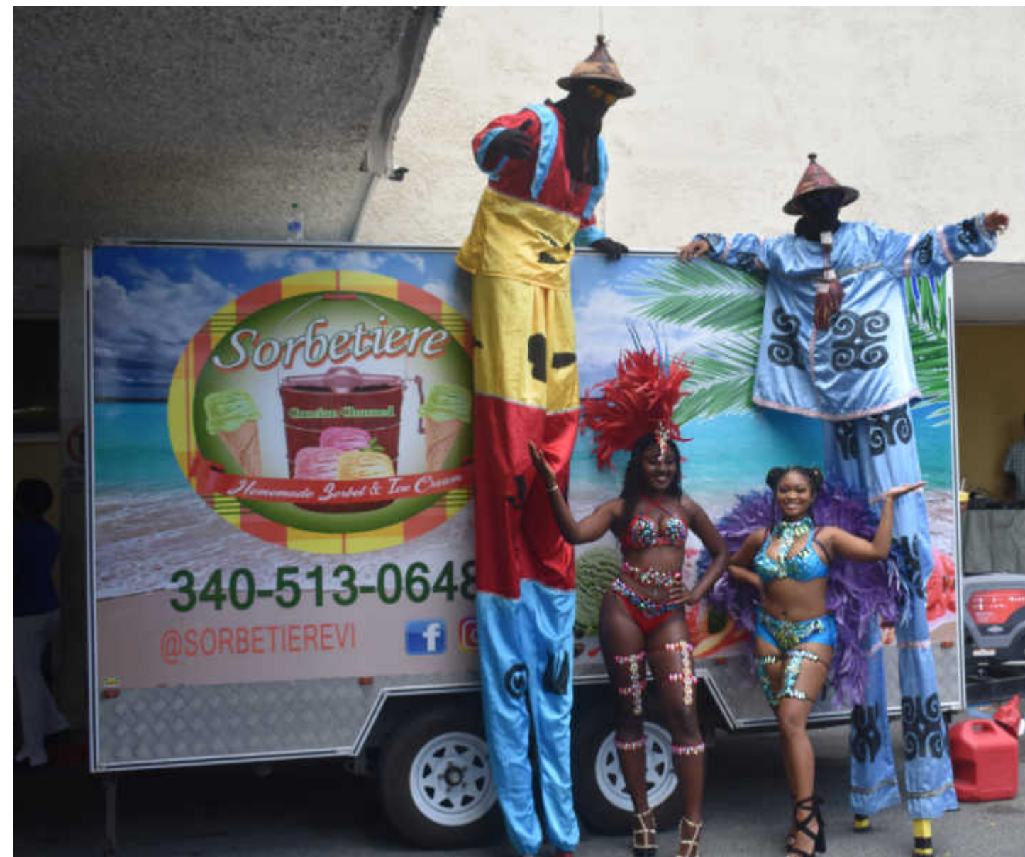
Entertainers, including Moko Jumbies and Kaiso Entertainment dancers, pose for a picture during Dept. of Tourism's JFL appreciation event on Friday, May 21, 2021.