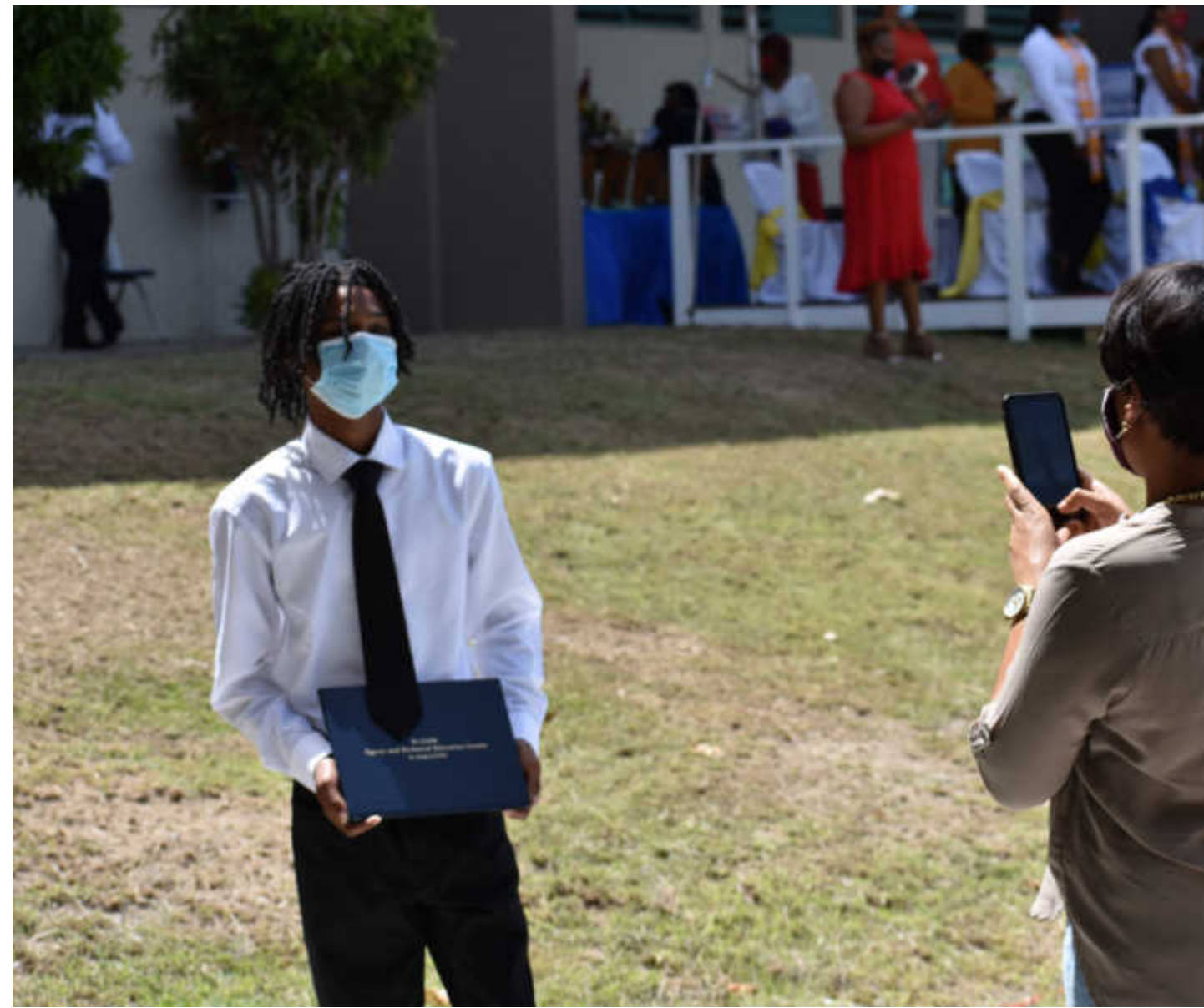
A parent snaps a picture of a young man during CTEC's graduation event on Monday, May 17, 2021.

"All of the speeches and everything are already virtual; all they're going to do is stick in the graduation part of it and the graduates will have an entire ceremony that they can have forever and ever," Mr. Bryan said. He said this will allow the students to see "all the remarks from the Senate president, myself, the Delegate to Congress — everybody. We just wanted to make sure that we get people in and out of a situation."