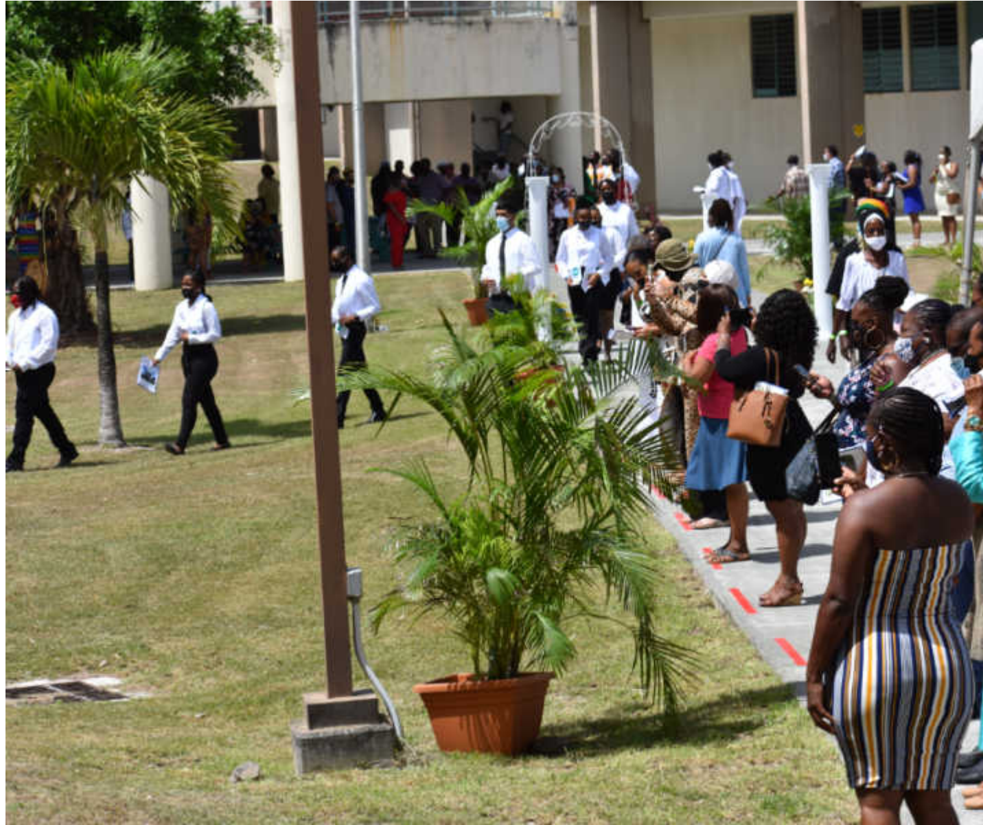
CTEC students divert to receive certificate while parents continue on a straight path to meet students at the end of the walk, then to be escorted out the area.

For the CTEC walk-thru, parents/guardians walked with the respective graduates for about 25ft, then separated so the students could collect their certificate and be elbowed by dignitaries in lieu of handshakes. Meanwhile, parents continued walking a straight path to meet students at the end. They paused to take pictures while the students received their certificate. Thereafter, students and parents were led out of the area immediately at which point they were to exit the facility.