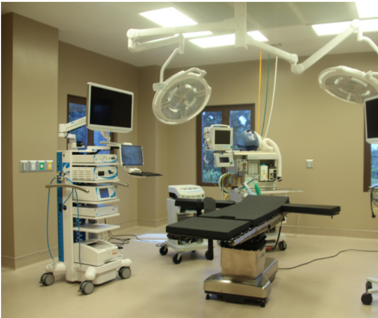
State-of-the-art surgical equipment at the St. Croix Surgery Center.