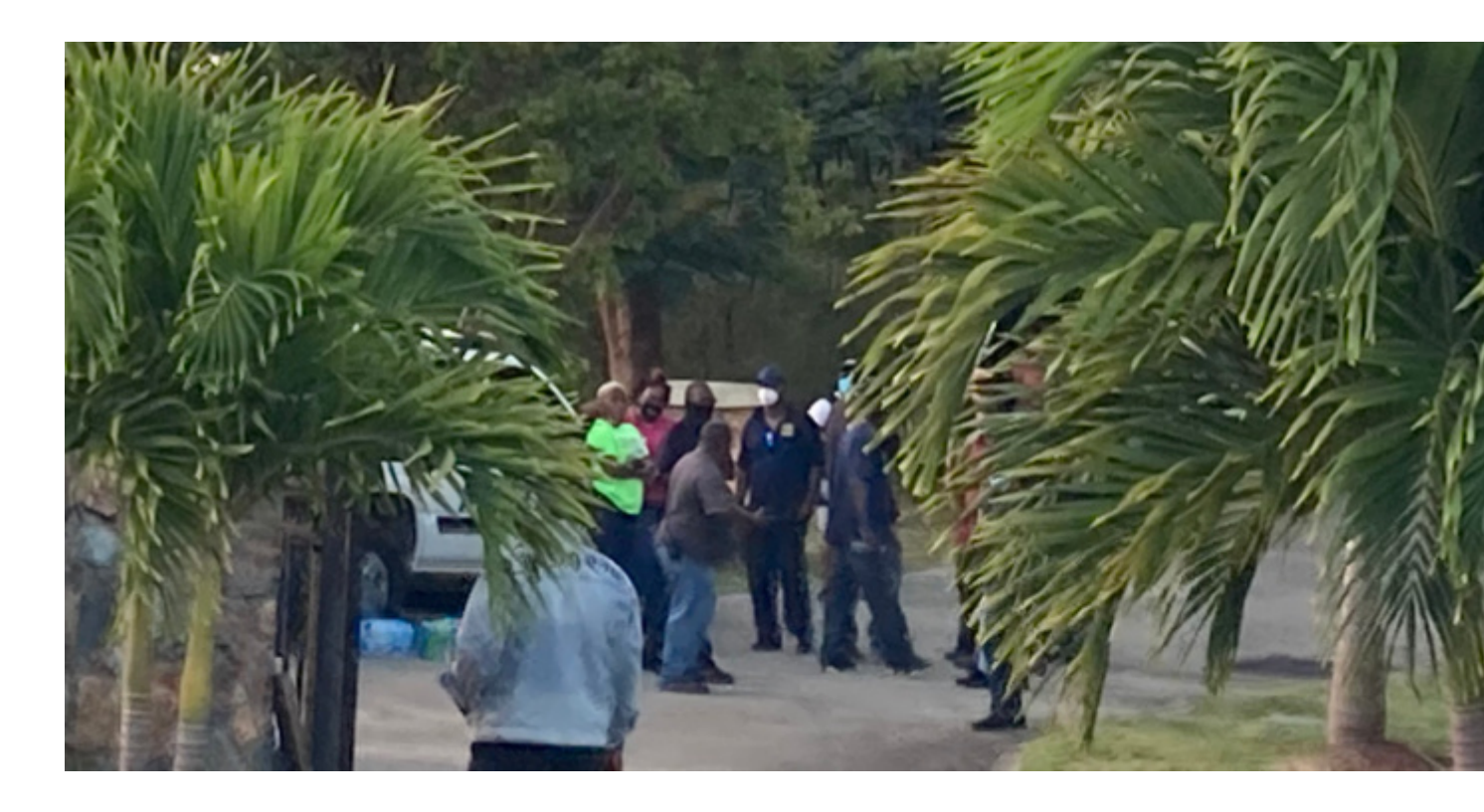
First responders near scene of helicopter crash