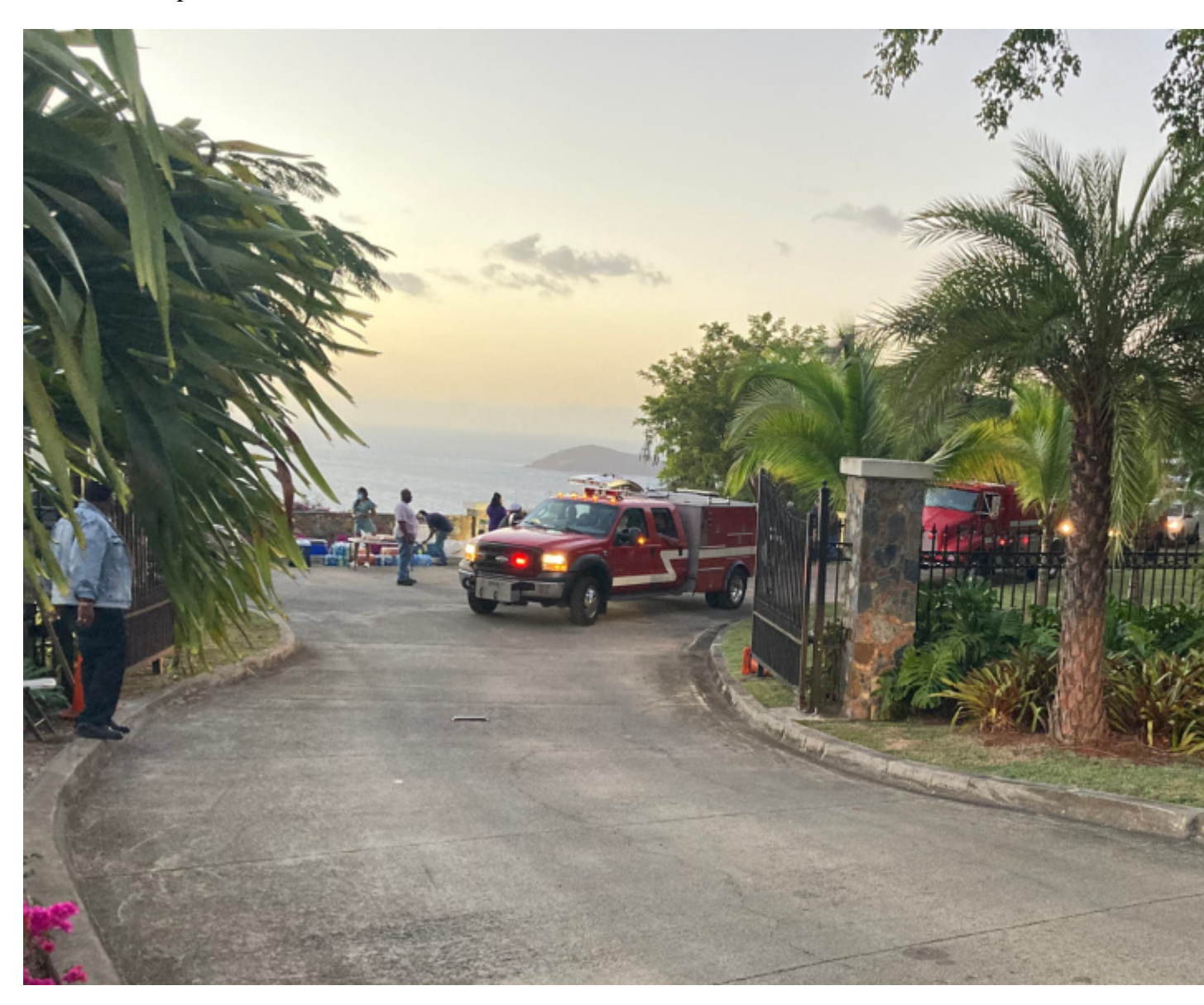
Fire personnel leaving scene of accident.