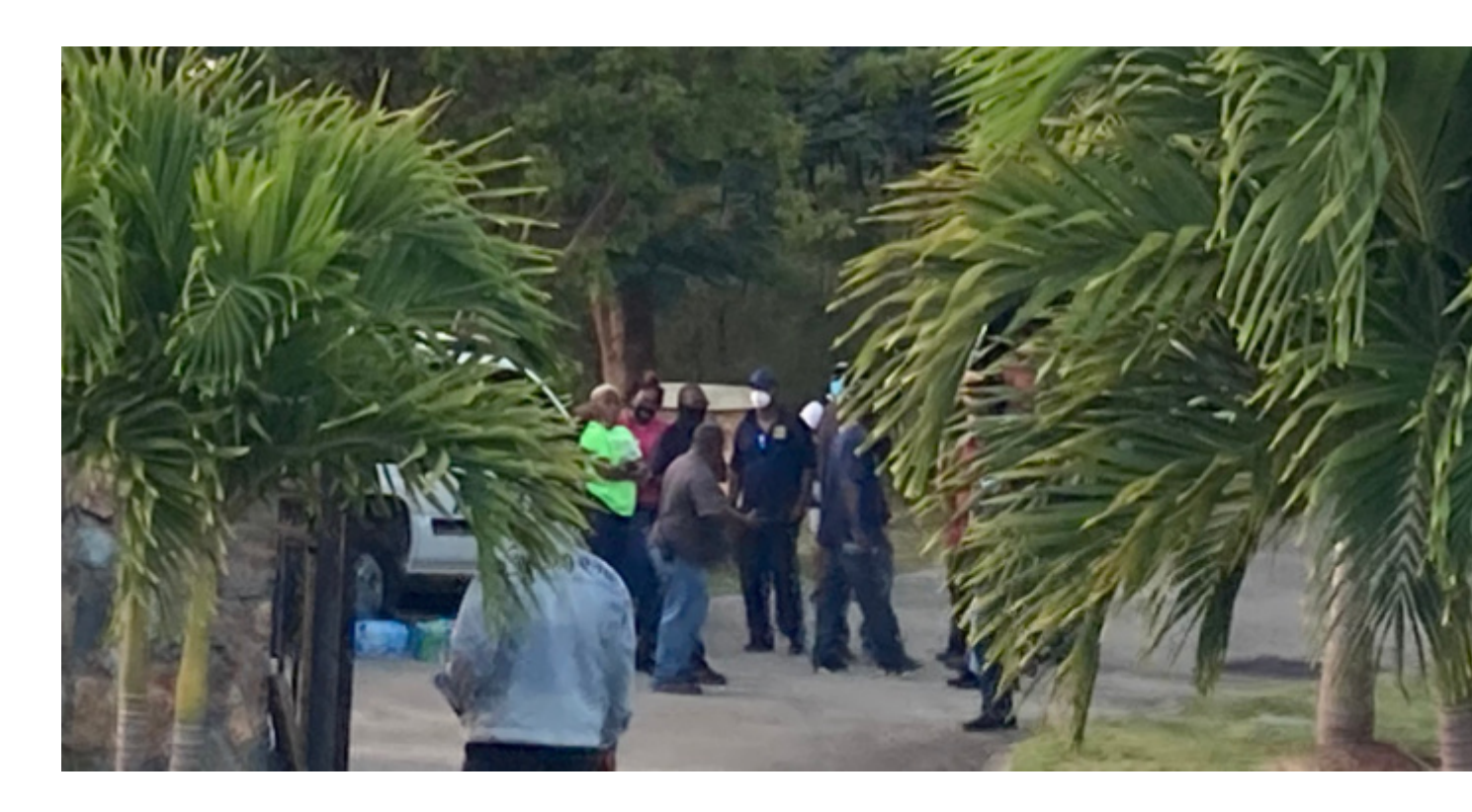
First responders near scene of helicopter crash