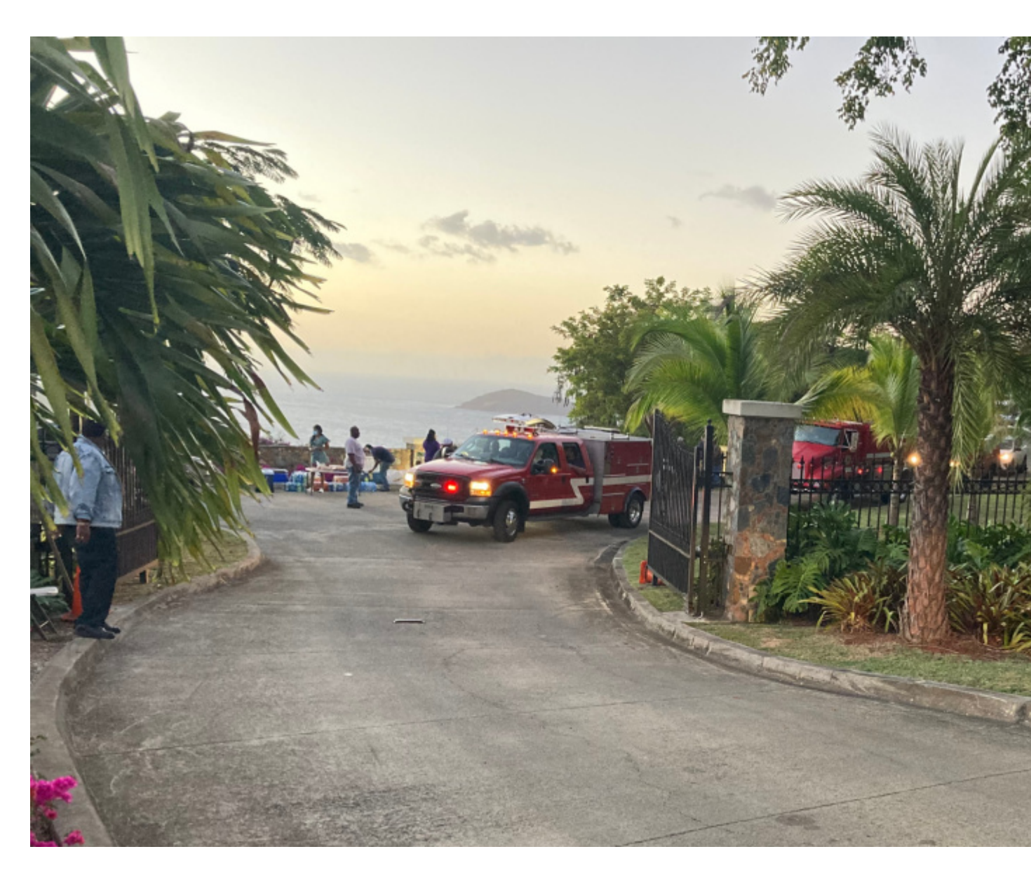
Fire personnel leaving scene of accident.