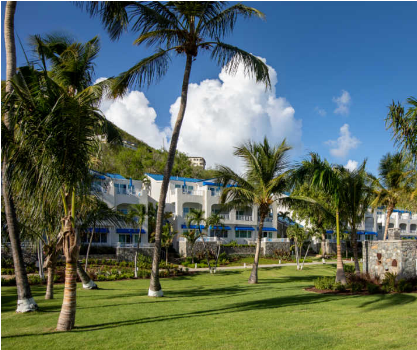
Limetree Beach Resort Exterior

This beachside resort property is nestled in Frenchman's Bay, with the Cyril E. King Airport a short 15 minute drive away. Guests can enjoy easy access to the downtown shopping district, Coral World Ocean Park and the St. Thomas Skyride that goes to Paradise Point. The shops, restaurants and historic attractions in Charlotte Amalie are all also just minutes away.