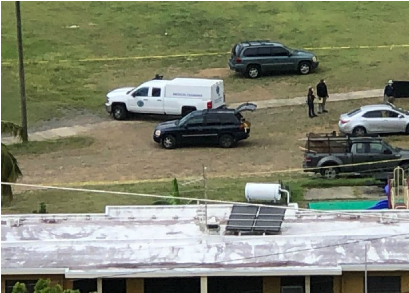
The Medical Examiner's vehicle on the crime scene at the Oswald Harris Court housing community on Sunday, Sept. 13, 2020.

Upon their arrival to the location, officers met an unresponsive black male, who was pronounced dead on the scene.