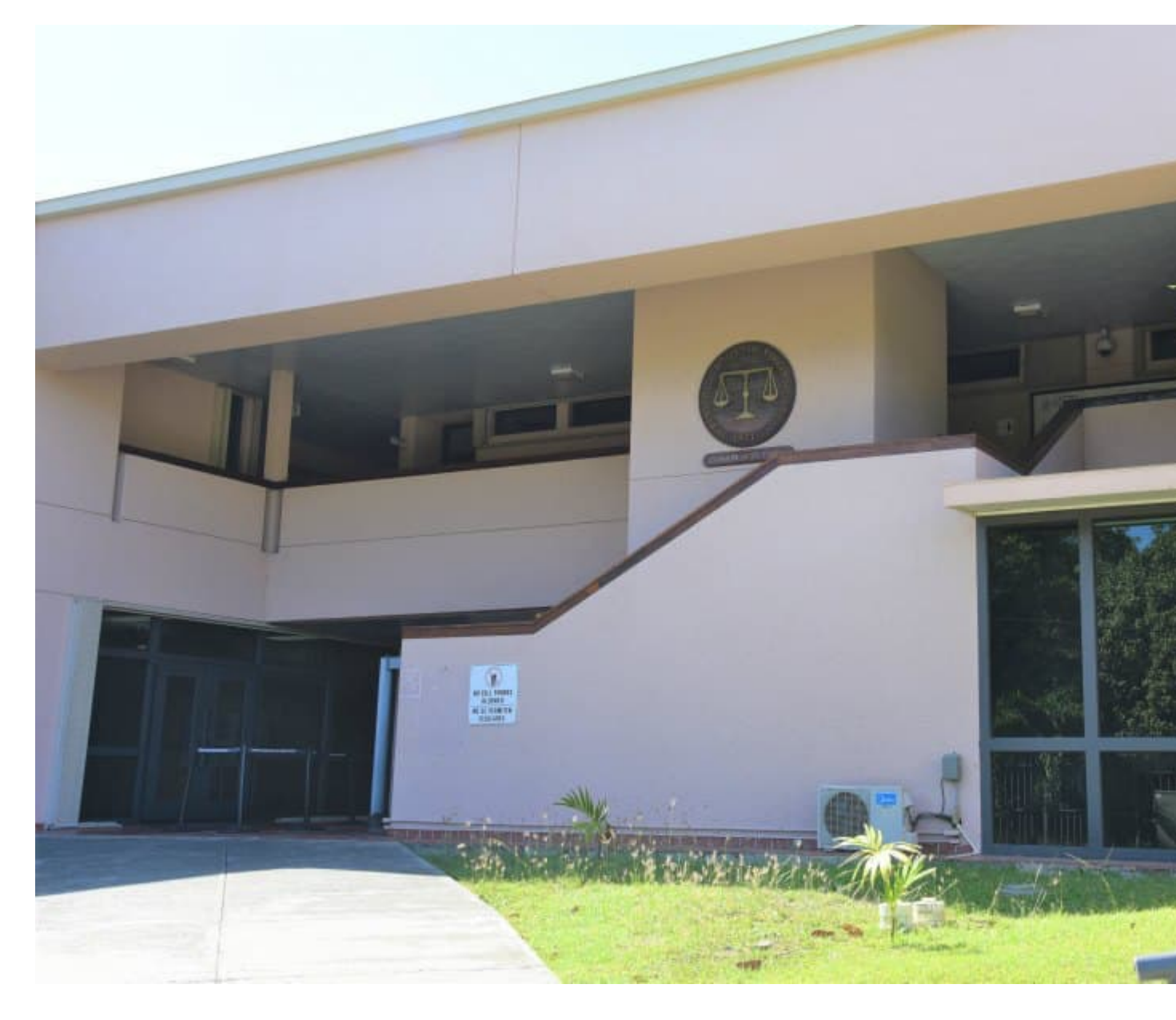
The V.I. Superior Court on St. Croix

In order to safely continue the court's vital operations on St. Croix, repairs were made in advance of FEMA's obligation, according to the release.