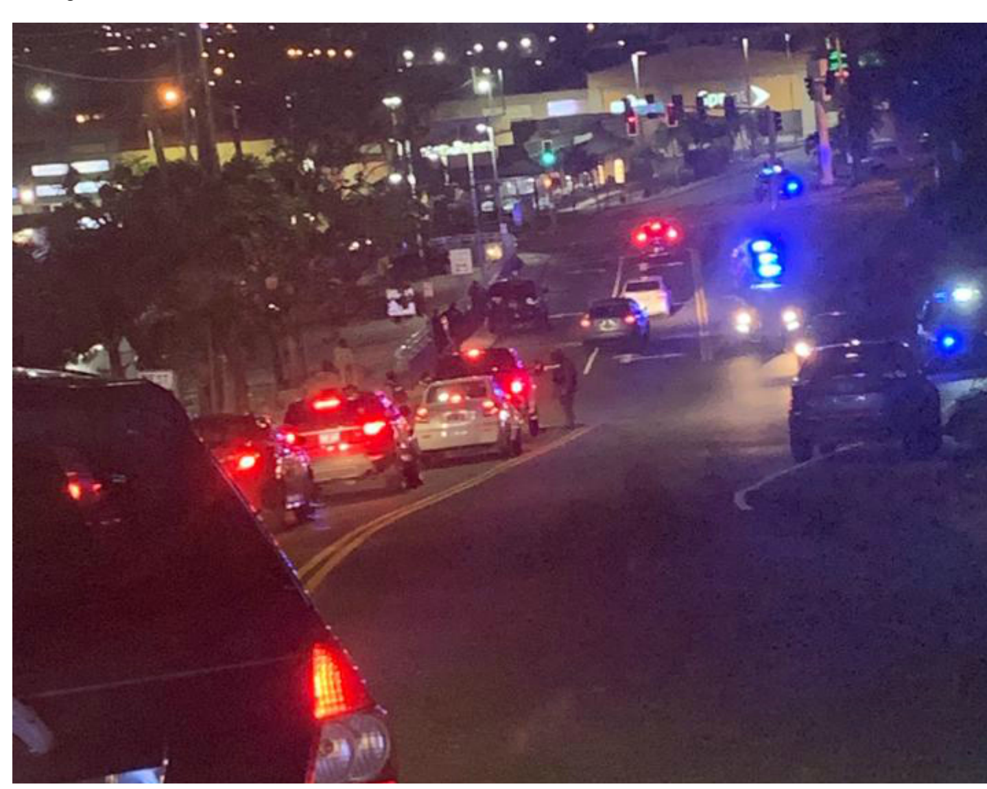
Virgin Islands Police make show of force with roadblocks on St Thomas Friday night.