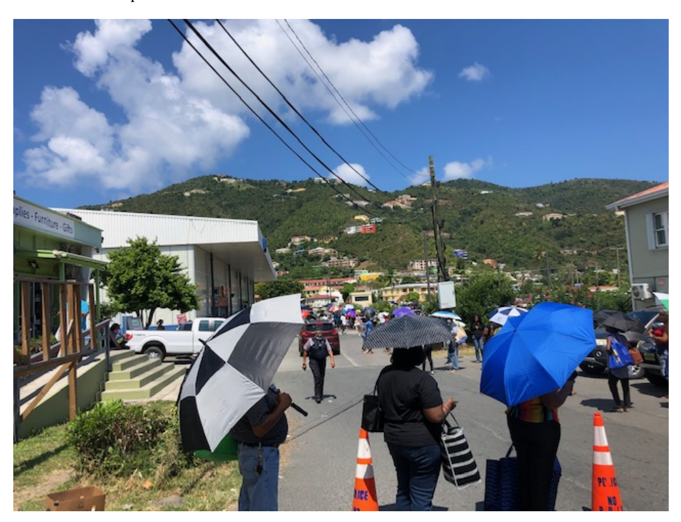
The BVI has 3 imported cases of COVID-19.

Friday and Saturday, persons from J-R and S-Z respectively will be allowed to shop and conduct essential services business.