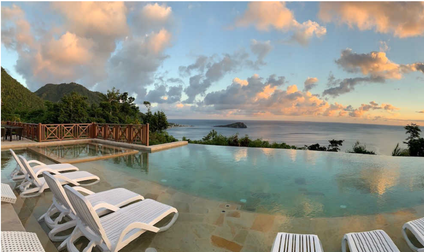
Jungle Bay Resort in Dominica.