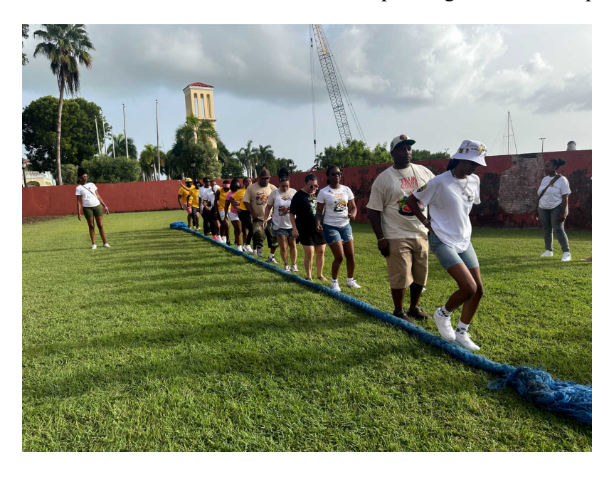
"Pon de River" competition during Tart Wars 2024 on Saturday, July 13

Groups of individuals wearing shirts matching their tart alliance were seen everywhere. A variety of entertainment, from music to dance, painting, and more, kept the atmosphere energetic.