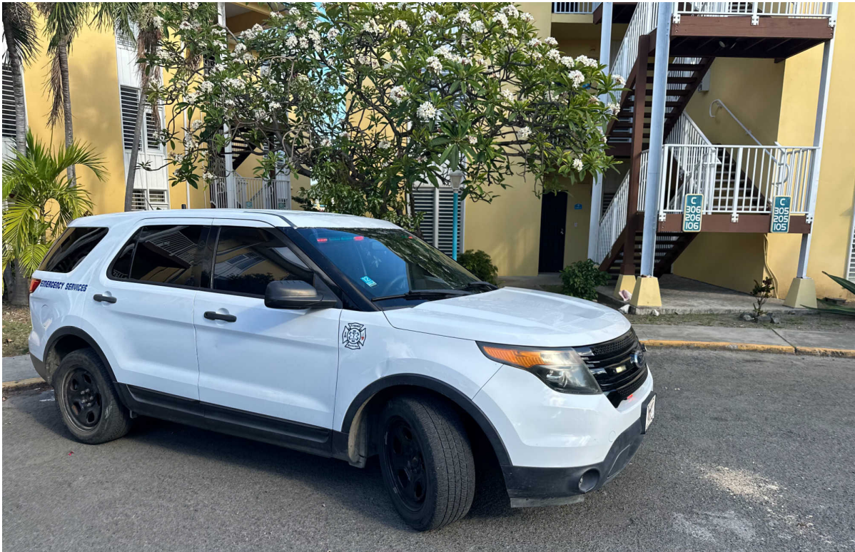
St. Croix Rescue on location at the Colony Cove Vacation Rentals facility in Golden Rock, St. Croix on Thursday, April 4, 2024.

Responding to the call, the V.I. Department of Planning and Natural Resources enforcement division, EMS, and the VIPD's marine units launched a search operation for the missing snorkeler.