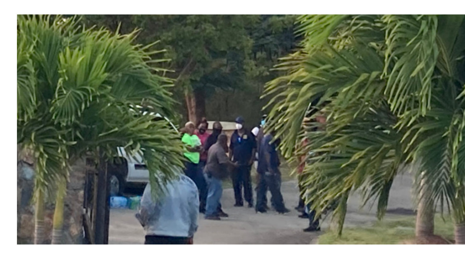
First responders near scene of helicopter crash

Fire personnel leaving scene of accident.