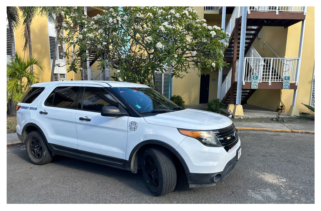
St. Croix Rescue on location at the Colony Cove Vacation Rentals facility in Golden Rock, St. Croix on Thursday, April 4, 2024.

Responding to the call, the V.I. Department of Planning and Natural Resources enforcement division, EMS, and the VIPD's marine units launched a search operation for the missing snorkeler.